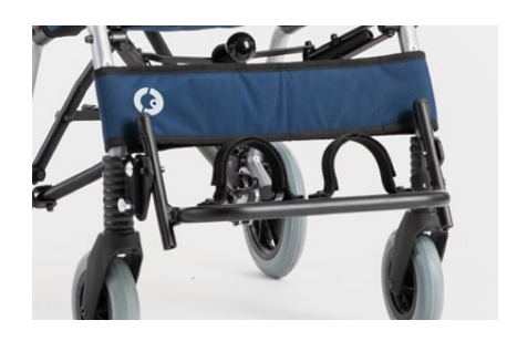
827 Foot straps