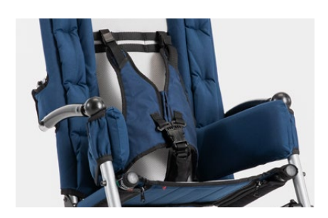
903 Five point vest harness