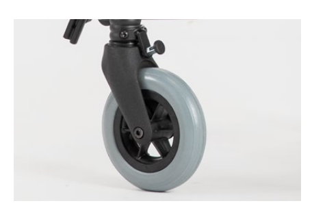
812 Directional locks for front wheels