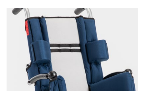
816 Lateral supports