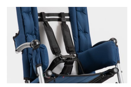
906 Five point harness