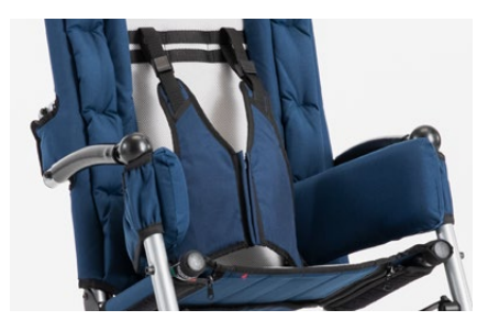
853 Vest harness