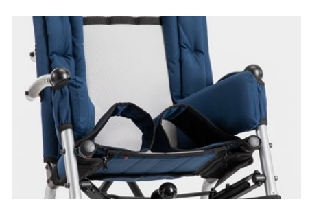
817 Leg straps for abduction