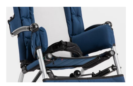
894 45° pelvic belt