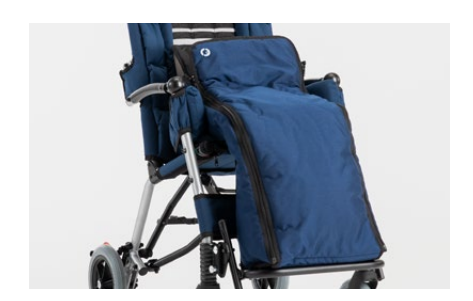
818 Thermal cover