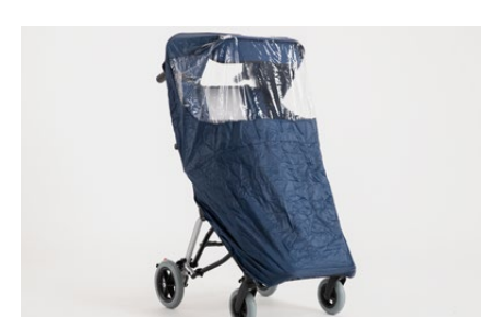
825 Rain cover to fix to the 819 canopy.